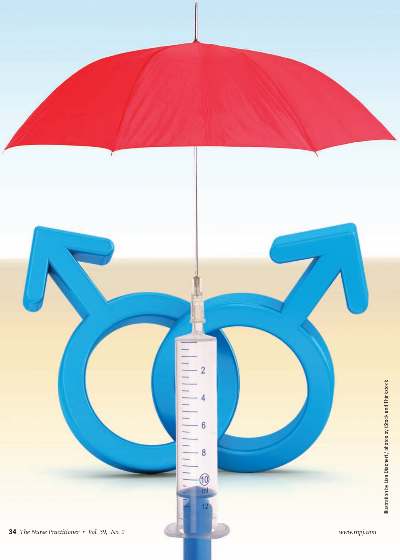
Illustration by Lisa Dischert